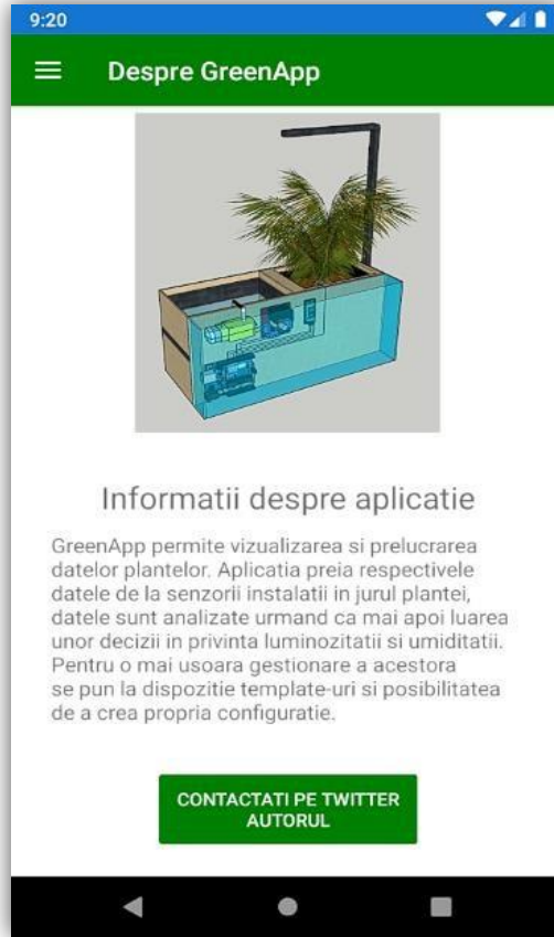
Figure 5.1. Application description page

Open page from the first button shows us the name of the accessed page in the top bar, a suggestive title in the middle of the screen, the text with the description of the application and an image of the device. (Figure 5.1.)