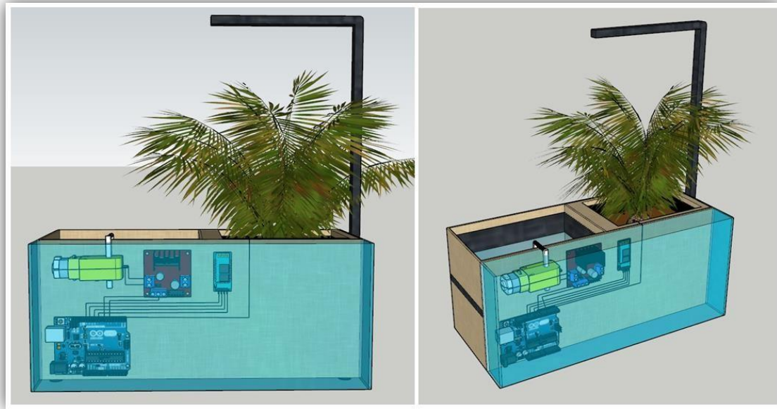
Figure 1.0. Smart plant care system through Bluetooth technology - Prototype in SketchUp