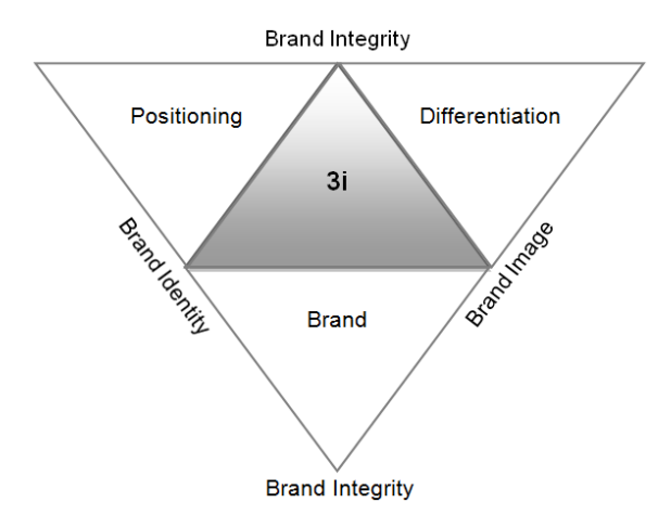
Figure 2. The "3i" model

"Romania, tourism destination" brand identity relates to the positioning of this brand in the customer's mind (the use of information from the online travel guides being necessary, but not enough). Positioning should be unique and relevant to the rational needs and desires of consumers. At the same time, brand integrity assumes the accomplishment of what is stated by brand positioning and differentiation. This means to be credible and to strengthen consumer confidence in your brand while respecting your promises.