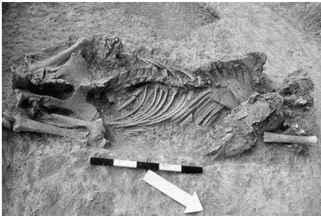
Fig. 3. Horse burial in the tumulus of Ladi (after Triantaphyllos Terzopoulou 2006).