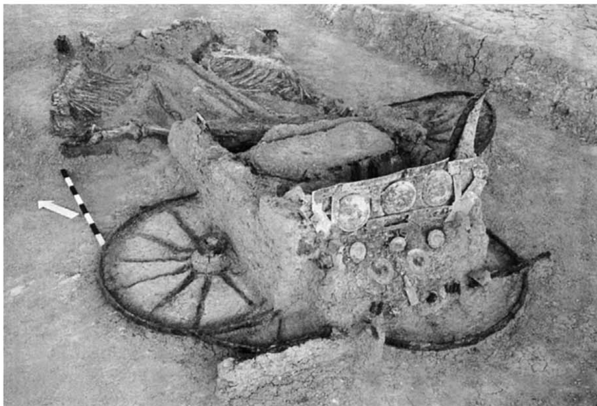
Fig. 2. Tumulus of Mikri Doxipara Zoni, Wagon B (after Triantaphyllos, Terzopoulou 2006)